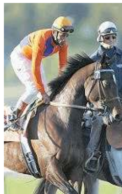
Action This Day

Breeders' Cup Juvenile winner Action This Day (Kris S.), most recently fourth in the Feb. 8 Sham S., worked