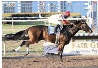
Badge of Silver

He faces a talented field of sprinters in just his second start following a 10 1/2-month layoff, but Badge of Silver (Silver Deputy) has been made the overwhelming early favorite for today's GII General George H. at Laurel Park. The four-year-old colt, listed at 4-5 on the morning line, took his first three starts by a combined 26 lengths, including a 10-length triumph in last year's GIII Risen Star S. at Fair Grounds. But he suffered a displaced palate and finished sixth in the GII Louisiana Derby,