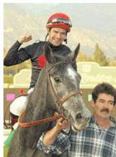
Island Fashion

Looking for her third consecutive Grade I victory, Island Fashion (Petionville) stretches out to a mile and a sixteenth for the Santa Maria H. at Santa Anita this