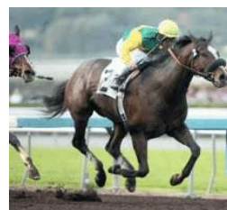
A.P. Adventure