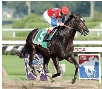
Medaglia d'Oro