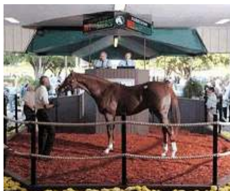
Hip 147