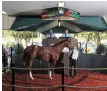
Hip 138