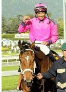
Bluesthstandard Benoit Photo