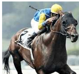
Pleasantly Perfect

The five-horse field for today's GII San Antonio H. at Santa Anita includes three Grade I-winning millionaires, a South American import looking for his second straight graded-stakes score and a veteran gelding who just