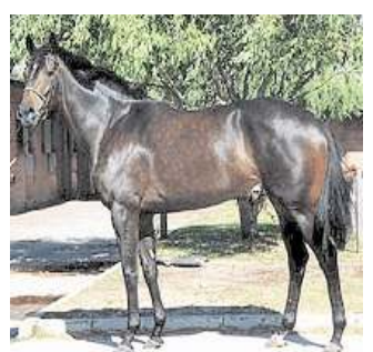
Crimson Palace

TEAM VALOR STRIKES AGAIN IN DUBAI Just a year after lpi Tombe (Zim) developed into one of the best turf mares in the world while wintering in Dubai, Team Valor has another potential star in the form of Crimson Palace (SAf) (Elliodor {Fr}), who scored an