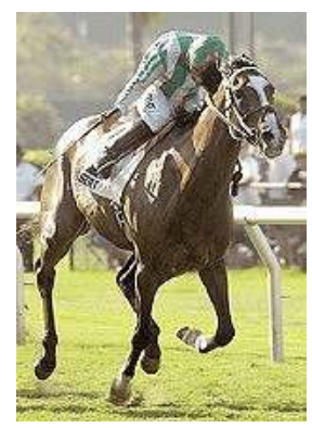
Dessert

DESSERT RETIRED The regally bred Dessert (Storm Cat--Windsharp, by Lear Fan), heroine of the GI Del Mar