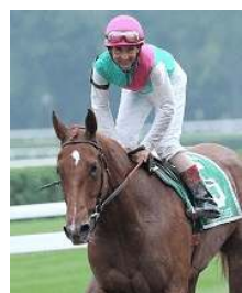
Sightseek A Coglianesa

Eclipse Award finalist Sightseek (Distant View), beaten a half length as the 7-10 choice last year, looks to redeem herself in this year's edition of the GI Santa Monica H. this afternoon. The chestnut mare has tried her luck over the Santa Anita strip four times before, but has yet to get to the winner's circle. Second in her first three Arcadia appearances at the beginning of 2003, she reeled off four consecutive Grade I wins when taken out of town for the heart of the campaign and was once again the odds-on favorite on her return for the GI Breeders' Cup Distaff.