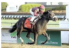
The Cliff's Edge