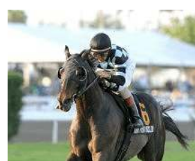
Man From Wicklow

Adminniestrator has shipped cross country to defend his title in this event, but he will have to face a very