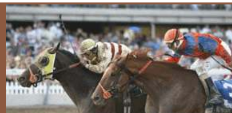
Puzzlement wins Hal's Hope-G3