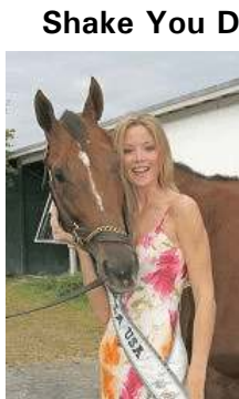
Shake You Down & Miss Florida USA

Shake You Down missed being a finalist for the Eclipse Award for champion sprinter, but the Florida-bred had an excellent year in 2003, winning the four graded stakes and finishing third in the GI Breeders' Cup Sprint. He tuned up for this contest with a victory in the Gill Gravesend H. Dec. 21. Valid Video , hero of last year's Sunshine Millions Dash, went on to capture the GI King's Bishop S. and the Gill Carry Back S., but closed out the year with a disappointing last-place finish in the Breeders' Cup Sprint.