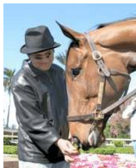
Pesci (left) & Pesci