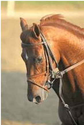
Peace Rules

A total of 85 horses will take to the Santa Anita and Gulfstream Park tracks in eight races to battle for state-bred supremacy in Saturday's second renewal of the Sunshine Millions. The $3.6-million program, which pits Florida-breds against California-breds, is headlined by the $1-million Barretts/CTBA Sunshine Millions Classic at Santa Anita. The Classic drew an overflow field of