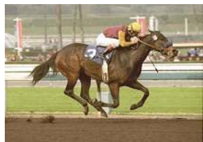
Yearly Report

Trainer Bob Baffert's Yearly Report (General Meeting) successfully traversed the ascent into graded company and ran away with yesterday's GII Santa Ynez S. at Santa Anita in stakes-record time. The handsome bay's only other two starts had been against fellow Cal-