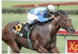
Second of June