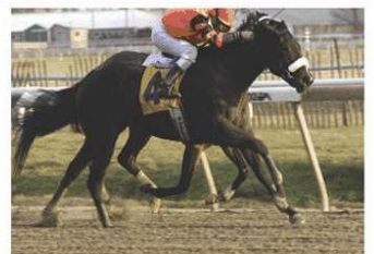
2004 STAKES WINNER

AMONG MY SOUVENIRS remained unbeaten with this Jan. 3 victory in the Marshua S. at Laurel.