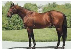
Broken Vow

Saturday's Child , selling as hip 1415 from the draft of Mill Ridge Sales, agent, elicited a bid of $260,000 from Domino Stud of Lexington, LLC. Out of the stakes-winning Capote mare Bashful Charmer, Saturday's Child won Delaware's Hildene S. as a two-year-old