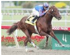
Lion Heart

One is an undefeated Grade I winner whose facile victories have the West Coast dreaming they have a Kentucky Derby contender. The other banked over a million dollars in 2003 and won two Grade I races, one at a mile and a quarter, the other at seven furlongs. The connections of Lion Heart and Island Fashion, however, will not be holding their breath at the Westin Diplomat Resort and Spa in Hollywood, Florida, awaiting the announcement of champion two-year-old colt and