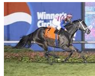
Dancal winning the Violet