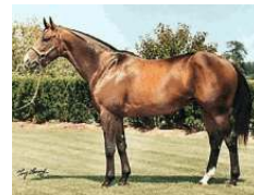
A.P. Indy www.lanesend.com

The weather outside might be a little frightful, but buyers and sellers hope the equine pickings are delightful as Keeneland kicks off the New Year with its January Horses of All Ages Sale this morning in Lexington. A total of 1,917 horses have been catalogued for the five-day auction, which includes 827 broodmares, 191 broodmare prospects, 634 short yearlings and 152 horses offered as racing or broodmare prospects. The numbers roughly correspond to last year's January catalogue, which featured 1,907 lots. "I think this is a typical January sale, very similar to last year," commented Keeneland Director of Sales Geoffrey Russell. "With the middle market being so strong for the last year and a bit, and the success of the September and November sale, I hope that will carry forward through the January sale." Sires represented by broodmares or their new yearlings include A.P. Indy, Cherokee Run, Deputy Minister, Distorted Humor, Dynaformer, Forestry, Forest Wildcat, Gilded Time, Grand Slam, Hennessy, Langfuhr, Mr. Greeley, Rahy, Royal Academy, Tale of the Cat, Thunder Gulch, Tiznow and Unbridled's Song.