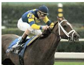
Harmony Lodge

Harmony Lodge (Hennessy) proved best in last year's GIII First Lady H. at Gulfstream and, coming off a three-month vacation, successfully defended her title with a rousing effort yesterday. The chestnut was as solid as they come in 2003, winning five of eight, including the GI Ballerina H. at the Spa and Belmont's GII Gallant Bloom H. Oct. 5, her final start of the year. Feeling