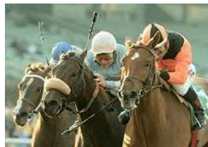
Spring Meadow (inside)

Originally a $13,000 yearling purchase, Spring Meadow was purchased by Fog City Stable for $200,000 as a two-year-old in training. That proved a smart investment as the chestnut won the Stonerside S., was second in the GI Prioress S. and the GI La Brea S. and third to You in the GI Test S. She added to her resume with a trio of stakes scores in 2003, including the GIII Las Flores H. at Santa Anita.