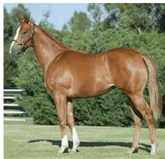
Lot 40

Magic Millions began on a decidedly strong note Thursday as domestic purchasers competed determinedly against a strong international contingent, helping to boost the session average to A$114,264 from last year's A$91,000. Trainer Gai Waterhouse struck early with a decisive A$650,000 winning bid for lot 57 , a Danehill--Sommes Sound (Assert {Ire}) colt offered by Stratheden Stud; Waterhouse also gave A$300,000 for the colt's full brother at Easter 2003. She trained the pair's half siblings, Assertive Lad (Aus) and Assertive Lass (Aus), to Group 1 success. "This colt had enormous presence," said Waterhouse. "The sale is extremely competitive and it is only going to get stronger." Redoute's Choice (Aus) (Danehill) averaged around A$160,000 with Magic Millions race favorite Not a Single Doubt (Aus) proving a capable advertisement for the young sire. Hong Kong Jockey Club gave A$240,000 for lot 89 , a Redoute's Choice--Suburban