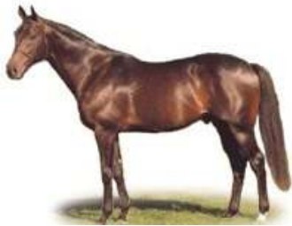
Broad Brush

Gainesway Farm stallion Broad Brush (Ack Ack--Hay Patcher, by Hoist the Flag) has been pronounced in good health and should be ready to begin the 2004 breeding season at the Lexington nursery. The 21-year-old stallion underwent fusion surgery last September to repair damage to his left front fetlock. Recent radiographs of the area show complete recovery from the procedure. A four-time Grade I winner in his three years at the track, Broad Brush is the sire