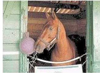
Funny Cide