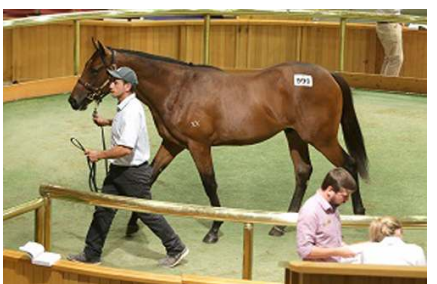
Yesterday's session-topping lot 999

"He's a lovely type of horse, he'll take a bit of time