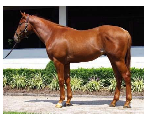
Saratoga Dreamer as a yearling

was thinking about a race here for him, but it got cancelled. I saw this race and was able to get him up there to run in it. Before he ever ran, he trained so well on the grass I felt I had to run him on the grass. The second time, I tried stretching him out to a mile, but he acted up badly