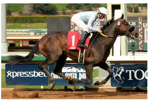
Prospect Park Renoit Photo

and trip Dec. 27. Always traveling strongly while saving ground from fourth in this five-horse affair, the 7-2 shot was on hold in search of room in upper stretch, but split rivals at the eighth pole and sailed clear under a hand ride to score a