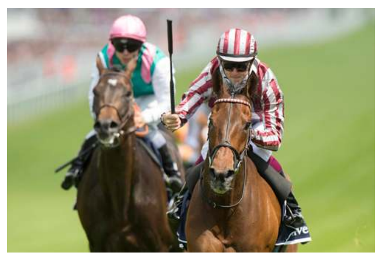
Cirrus des Aigles Racing Post

All horses in the TDN are bred in North America, unless otherwise indicated