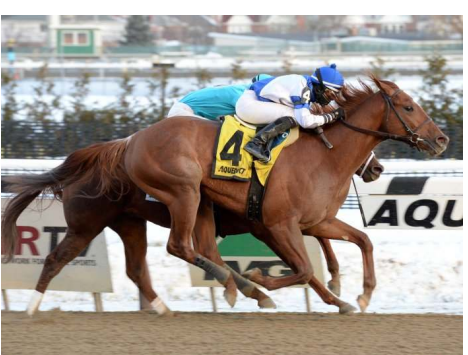
Saratoga Dreamer

Saratoga Dreamer ran to the money as the 3-1 favorite in his debut sprinting versus Empire-breds over the Saratoga lawn Aug. 20, then failed to deliver as the