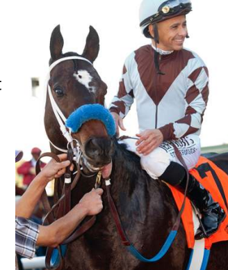
Distinctiv Passion