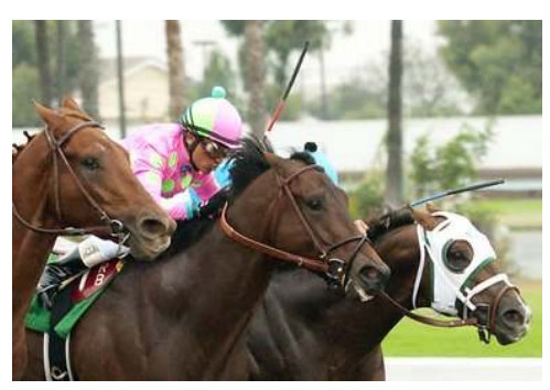
Firing Line (center)

3-year-olds. Zetcher's Firing Line (Line Of David), second, beaten only a head by Dortmund (Big Brown) in a thrilling renewal of the GI Los Alamitos Futurity Dec. 20 (video), remains on schedule for next weekend's GII