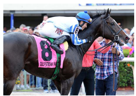
New York-bred Upstart (Flatter), winner of the recent GII Holy Bull S.

The stat, showing 1,603 live births, up from 1,534, is included in the annual report compiled by the fund's