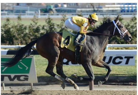
Ocean Knight