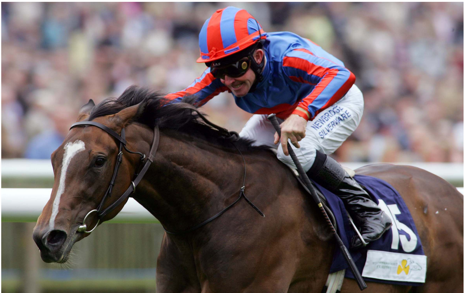
You'resothrilling (full-sister to Giant's Causeway) winning the 2007 G2 Cherry Hinton S. at Newmarket. She's now the dam of Gleneagles, Marvellous, Happily, Taj Mahal and Coolmore.

It was agreed from the start of his second career that, despite his brilliance and the attendance of outstanding mares, Frankel would be hard pushed to emulate Galileo at stud. He of course follows a distinguished line, not just Galileo, but Sadler's Wells and Northern Dancer before him, so anything short of stellar results would be deemed disappointing. Cont. p3