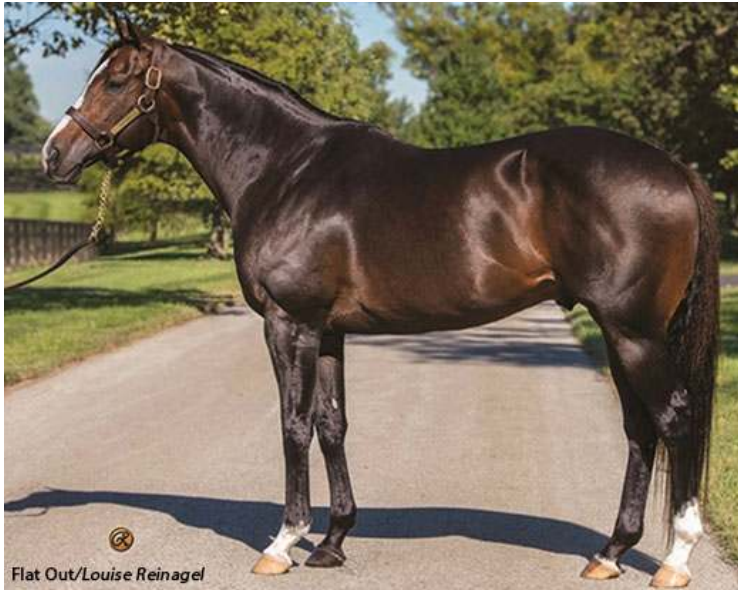
Flat Out | Louise Reinagel