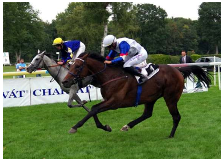
Passepartout (1) grabs Zoriana, conqueror of males in the Slovenske Derby, in the shadow of the post