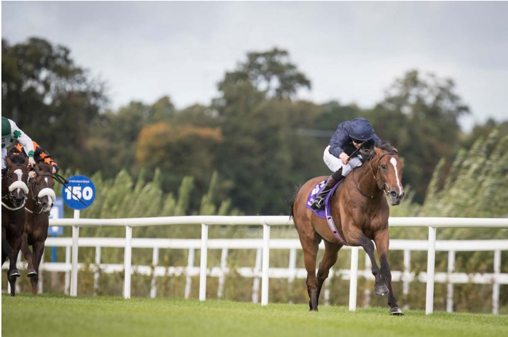
Nelson striding clear gives Frankel another stakes winner | Racing Post

Even with just two crops of racing age, Frankel is starting to live up to his extraordinary reputation. Yes, we're still waiting for that first Group 1 winner in Europe and if Juddmonte would just withdraw Enable perhaps that would come in the form of Cracksman in the Arc. But joking aside, three stakes winners in three days this week in America, Ireland and France is not to be sniffed at, while the emergence of some exciting juveniles has added lustre to his second crop.