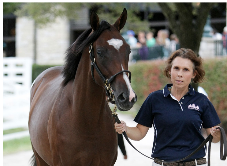
Hip 128 at the walk