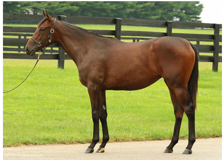
Hip 82