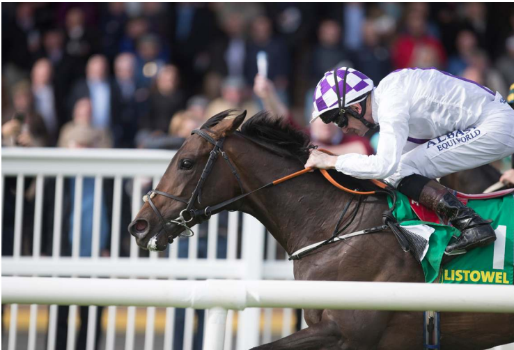
Warm The Voice salutes in a Listowel handicap Monday.