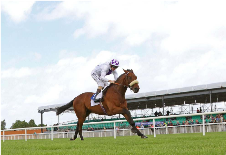
Verbal Dexterity | Racing Post