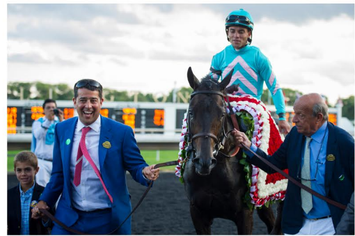
Jockey: Joel Rosario & Trainer: Chad Brown