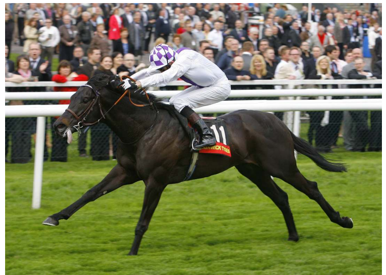
Vocalised during his racing days