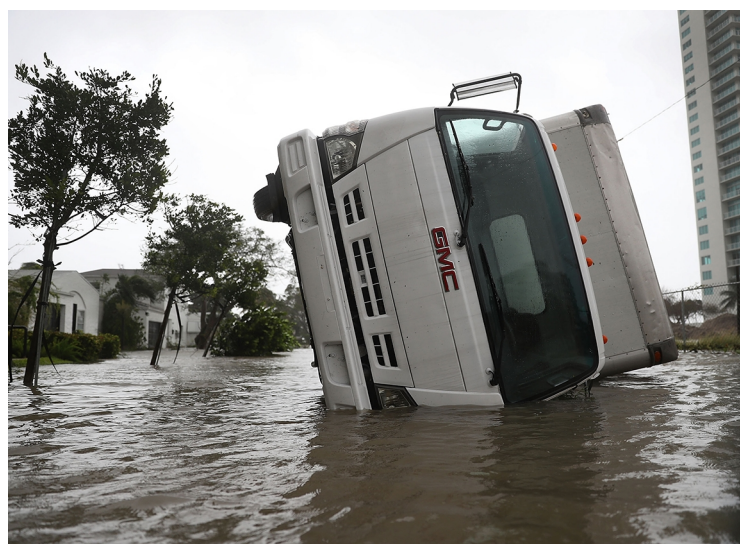
A truck is seen on its side after being blown over as Hurricane Irma passed through Sept. 10 in Miami, Florida. Hurricane Irma, which first made landfall in the Florida Keys as a Category 4 storm Sunday, has since weakened