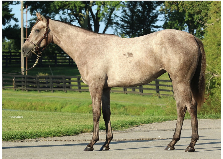
Hip 69

Considering the success Coolmore has had--and apparently expects to have in the future--with Cupid (Tapit), it should have come as no surprise that they came out on top Monday for the full-sister to their 2017 GI Gold Cup at Santa Anita winner. Hip 69 was the session's priciest yearling at $2.7 million, and was consigned by VanMeter-Gentry Sales, Agent XI. Cont. p8