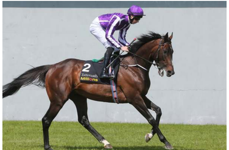
Camelot pictured at The Curragh in 2013