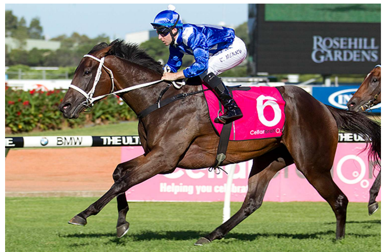
The mighty Winx | Racing And Sports