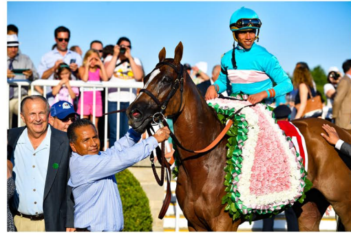
Jockey: Irad Ortiz Jr. & Trainer: Chad Brown