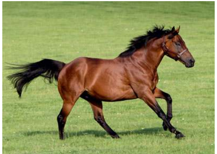
Dubawi didn't allow Galileo or Frankel to hog the stallion headlines