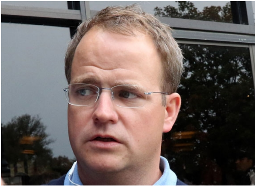
M. V. Magnier signed for the day’s top offering

expensive lot, going to $2.7 million for a full-sister to Grade I winner Cupid (Tapit) (hip 69). In addition to Cupid, who won the GI Gold Cup at Santa Anita S. in May, Tapit has been represented this year by GI Belmont S. winner Tapwrit and GI Del Mar Oaks winner Dream Dancing.