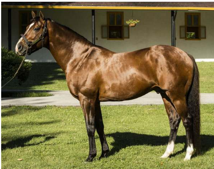
Data Link has a runner at Newcastle today | Claiborne Farm

MOST IMPROVED (IRE) (Lawman {Fr}), Coolmore Stud 72 foals of racing age/7 winners/0 black-type winners 3-LISTOWEL, 8f, FLINDT (IRE) €26,000 Goffs November Foals 2015; 12,000gns Tattersalls October Yearling Sale 2016 - Book 3