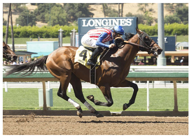
Run Away

Run Away, an odds-on winner on debut, took all the money once again in the Santa Anita Juvenile S. and rewarded his backers, kicking away late from a stubborn pace companion to remain undefeated. Made a 7-10 proposition here May 26, the $325,000 Barretts March buy dueled for the lead early before scooting clear into the stretch and coming home a 2 1/4-length graduate. Off at odds-on in this stakes bow, the bay sparred with Argosy Fleet in the two-path through a :21.78 quarter. That pair remained inseparable until the final 100 yards, when Run Away just started to do the better work, edging clear to score. The victor has a yearling half-sister by Yes It's True who is offered as Hip 205 at next Tuesday's Fasig-Tipton July sale, and a weanling half-brother by Munnings.