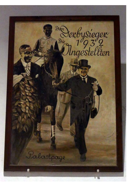
The print at Gestut Rottgen of their first Derby winner Palastpage

Another stallion to make a similar move from the Flat to the jumps ranks was Shirocco (Ger) (Monsun {Ger}), whose Group 1 wins included the Deutsches Derby, Coronation Cup and Breeders' Cup Turf and enticed Darley to buy him from