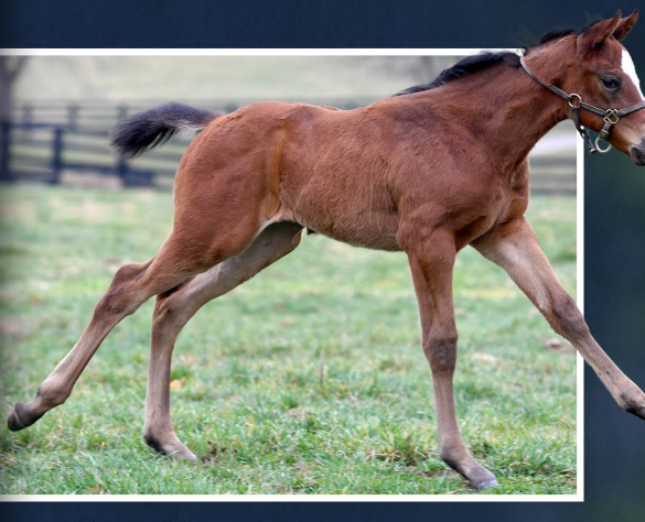
Filly 0/0 Fighter Wing Breeder: Twin Creeks Farm

111 BEYER Still the single fastest TAPIT around two turns