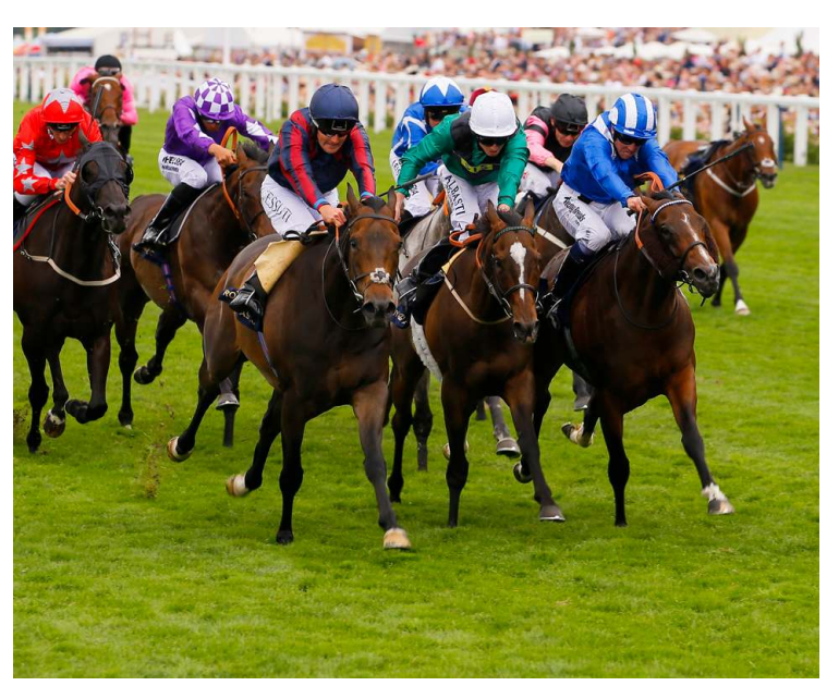
The Tin Man, nearside, fends off Limato and Tasleet