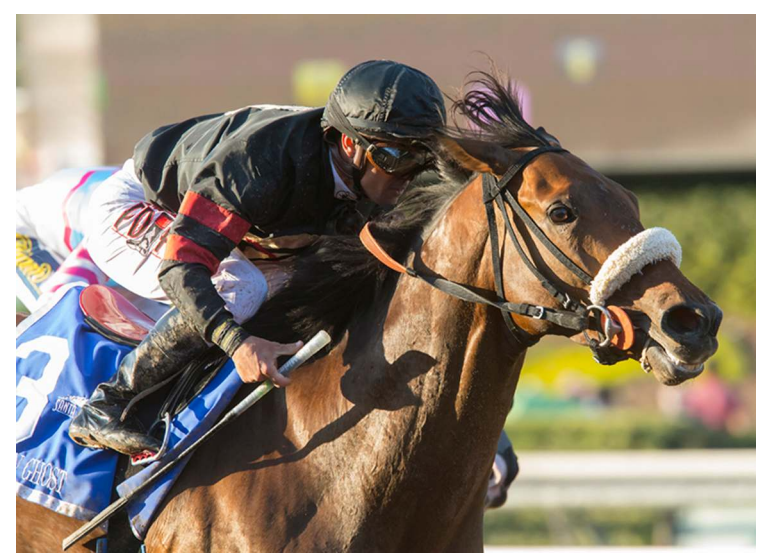
Shaman Ghost | Benoit