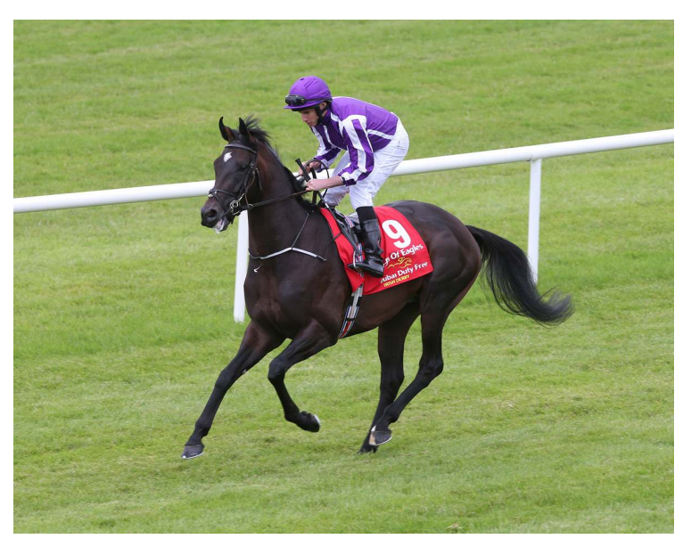
Wings Of Eagles cantering to post at The Curragh | Racing Post