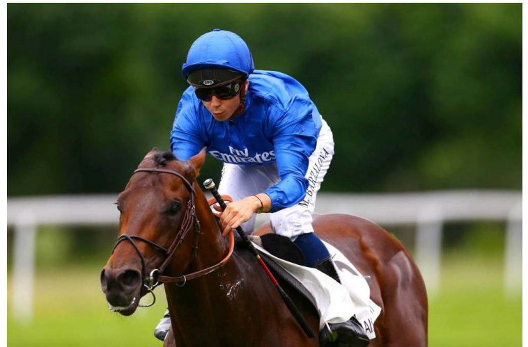
Inns Of Court