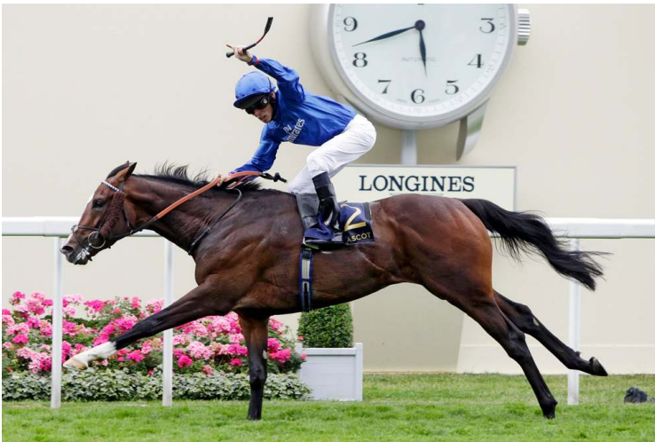
Atty Perse