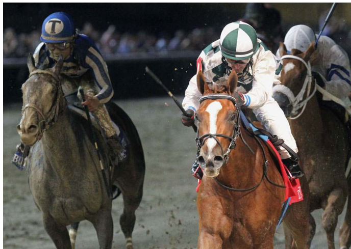
Sunny Skies splashes home in the Debutante