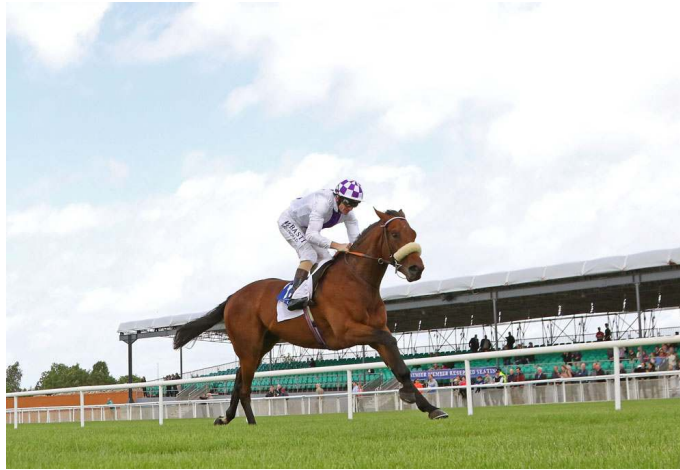
'TDN Rising Star' Verbal Dexterity | Racing Post