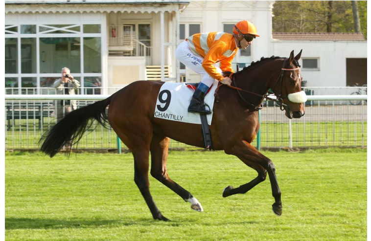
Trixia

Stallions represented in the sale include European champion juvenile Dabirsim (Fr) with eight lots, who recently celebrated his first group winner with G3 Albany S. heroine Different League (Fr), Elusive City, Harbour Watch (Ire), Kodiak (GB), Rajsaman (Fr), Siyouni (Fr), and Wootton Bassett (GB).