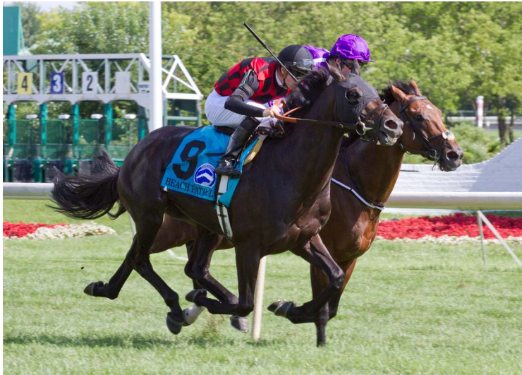
Beach Patrol | Four-Footed Fotos