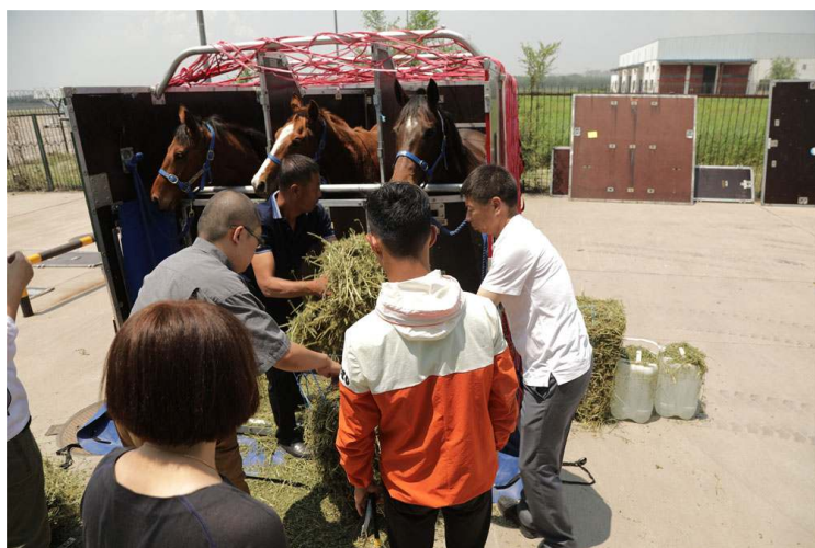
Australian Thoroughbreds arrive in China | Daluma.com