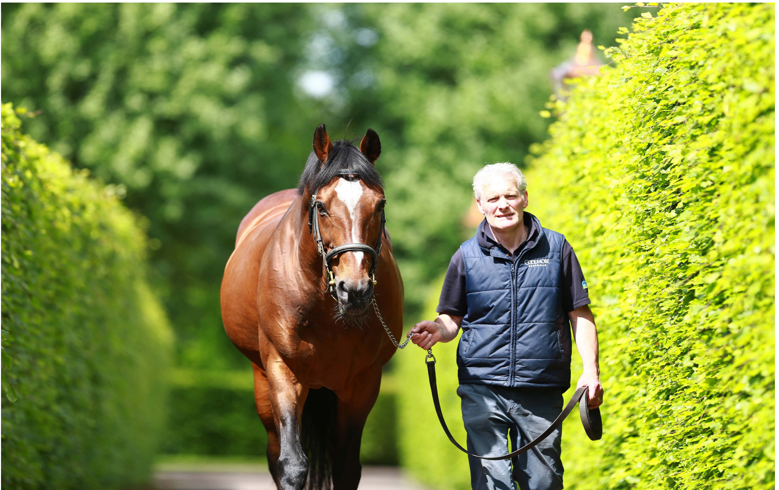
Galileo - winner of the 2001 Irish Derby. Sire of Frankel, Teofilo, New Approach, Found, Highland Reel, Australia, Minding... | Coolmore Stud