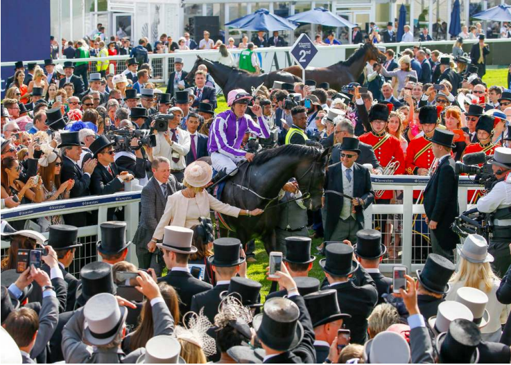
Wings Of Eagles seeks a Derby double | Racing Post