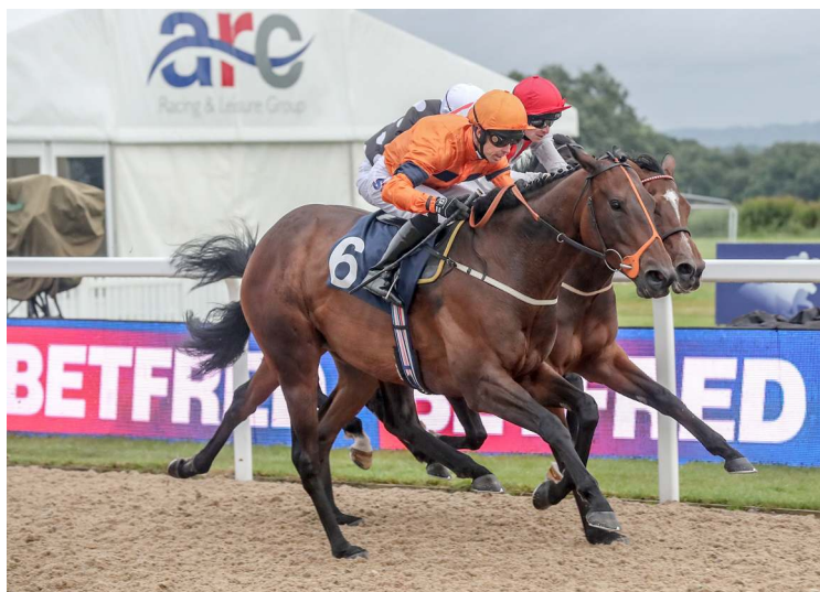
More Mischief | Racing Post