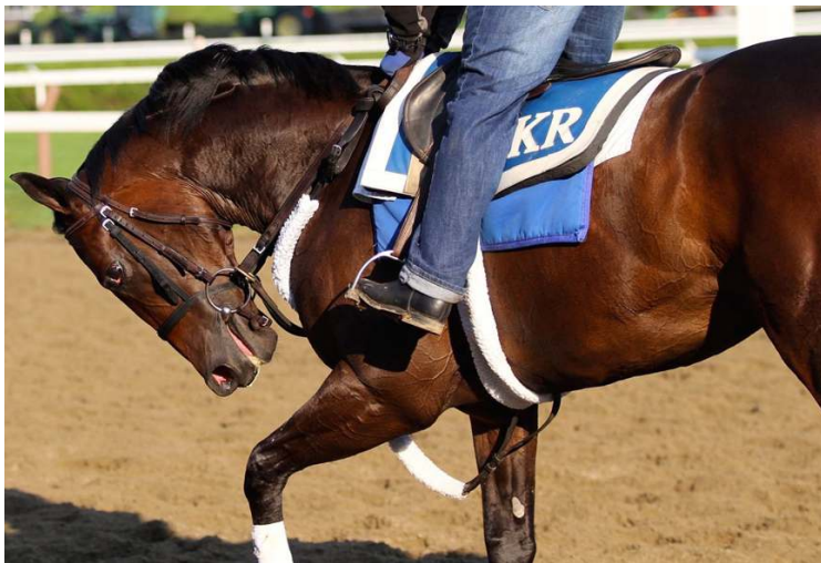
Classic Rock