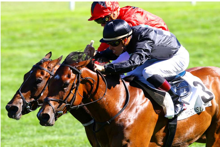
Ardenode | Scoop Dyga