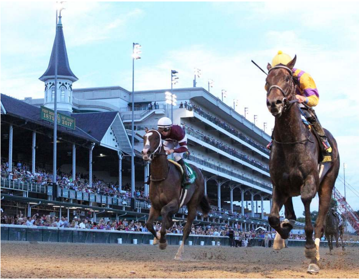
Ten City (r) bests Copper Bullet in the Bashford Manor

Ten City (Run Away and Hide) made good on his “ TDN Rising Star ” tag and impressive debut with a solid score in the GIII Bashford Manor S. Friday evening beneath the Twin Spires. Romping by seven lengths in his Keeneland unveiling Apr. 19, he was hammered down to 1-2 favoritism to take his record to two-for-two while receiving Lasix for the first time here.