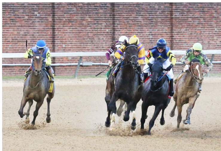
Ten City (yellow cap) takes the lead