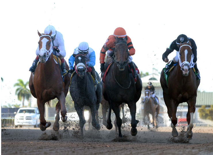
(L to R) Distinta, Wheatfield & Dearest

The top three finishers from Gulfstream's GII Inside Information S. Mar. 18, led by winner Distinta (Summer Bird), will face off once again as they battle for a spot in the starting gate for the GI Breeders' Cup F/M Sprint in the track-and-trip GII Princess Rooney S. Saturday. Third to the reopposing Curlin's Approval (Curlin), who was fifth in the Inside Information, in the GIII Hurricane Bertie S. Jan. 28, Distinta missed by a neck in the White Pearl S. Feb. 18 prior to her Inside Information win last time. The chestnut is scheduled to sell in the July 10 Fasig-Tipton July Horses of Racing Age Sale.