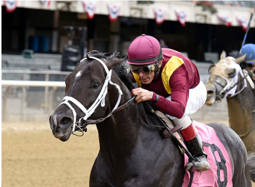
Coal Front | Sarah K. Andrew

COAL FRONT (c, 3, Stay Thirsty--Miner's Secret, by Mineshaft) was tabbed a 'TDN Rising Star' after annexing his six-furlong debut at Keeneland Apr. 20 by 6 1/2 lengths. The dark bay resurfaced here as a heavy favorite and, despite acting up a bit behind the starting gate, delivered the goods with an authoritative victory. The $575,000 OBS April buy broke alertly and pressed the