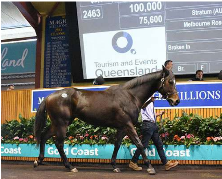
Thursday's top lot 2463

He added, "The vendors and their staff, buyers, Magic Millions team, bar and wait staff, grounds and night crews, however special mention to the transport companies and their staff for what was an unprecedented logistical exercise, to turn the place around three times is a fantastic performance."