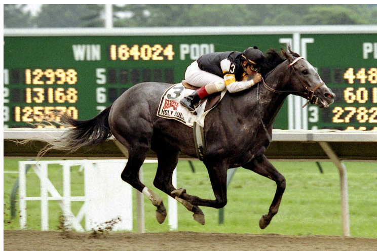
Holy Bull winning the 1994 Haskell