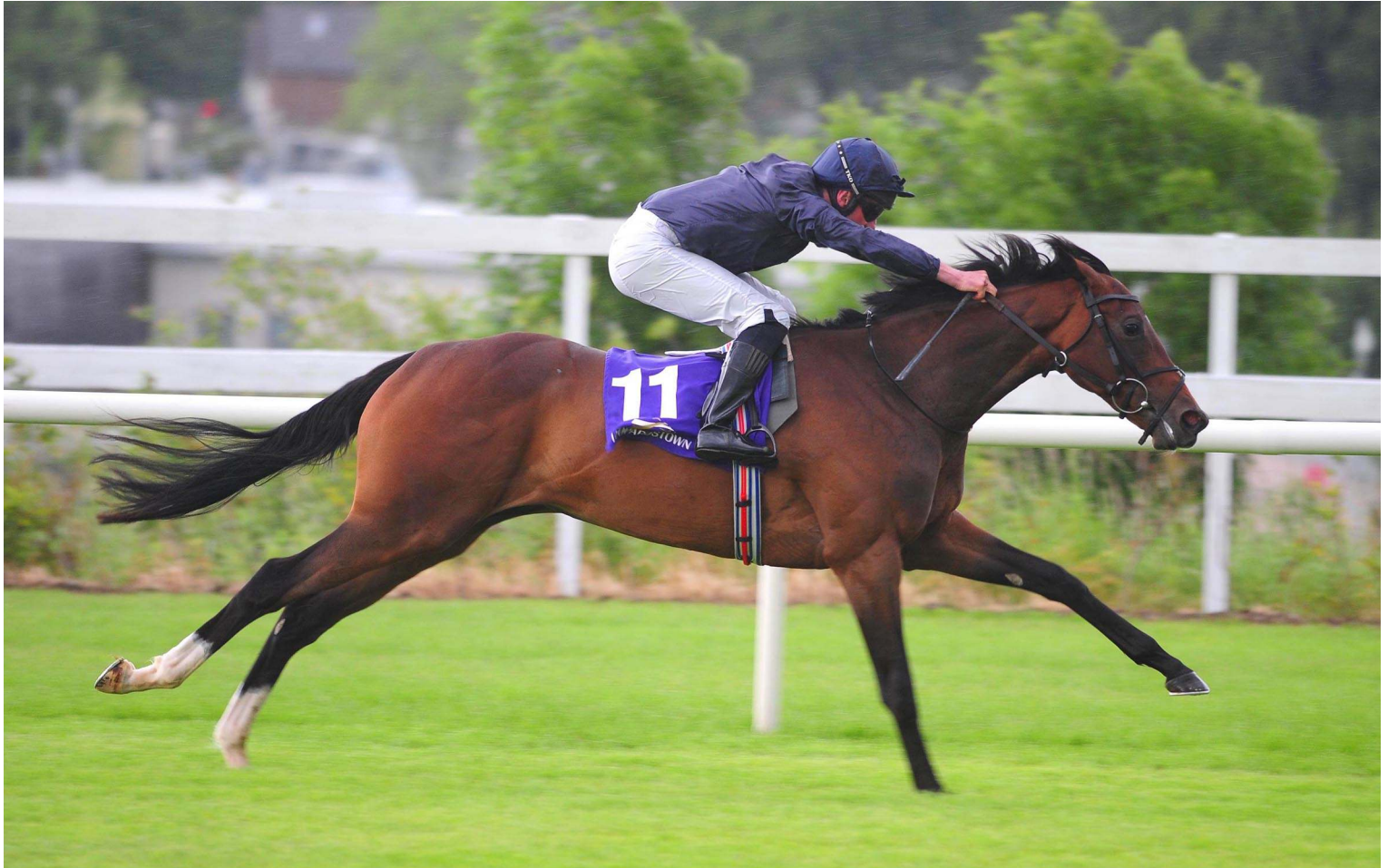
September (Deep Impact--Peeping Fawn) becomes a TDN Rising Star at Leopardstown