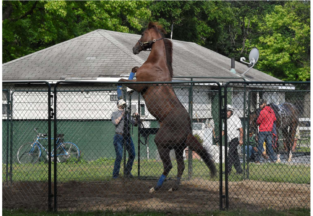
Irish War Dance. 'TDN Rising Star' Irish War Cry blows off a little steam in the round pen Thursday morning at Belmont Park.