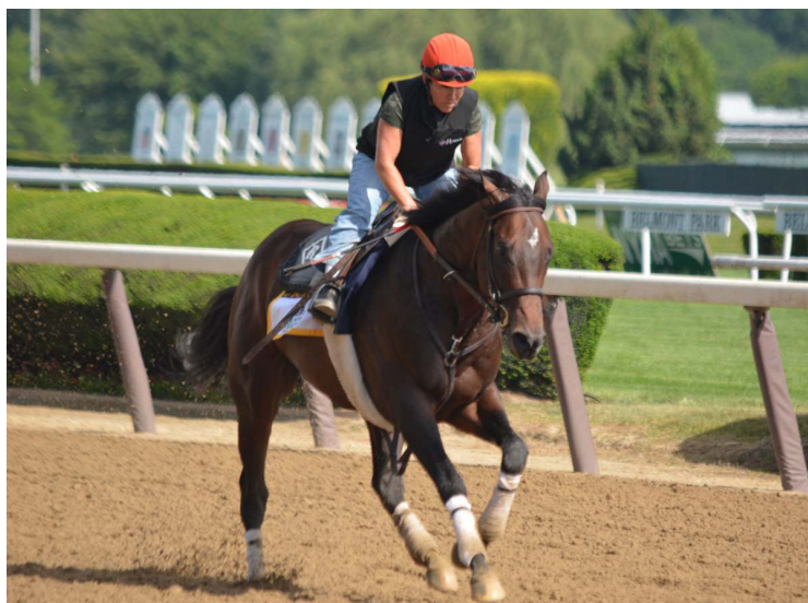
J Boys Echo | Sherackatthetrack

"He's trained up to the race beautifully and we're up to the part where it's up to the racing gods. All the signs heading into the race have been very positive." -trainer Brian Lynch on Meantime