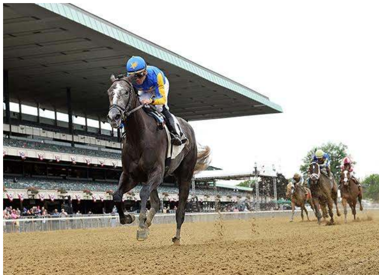
Stormy's Song

Stormy's Song (Unbridled's Song) led wire-to-wire to win her career debut and earn 'TDN Rising Star' honors, kicking off GI Belmont S. week with a bang. The gray posted a steady series of works at Keeneland and Belmont in recent weeks and was let go at odds of 9-1 here. Away without incident, she showed the way comfortably through fractions of :22.17 and :45.48. Shaking off her closest pursuer spinning into the stretch, Stormy's Song drew clear to notch a seven-length victory. Privy Council (Majesticperfection), returning from a year-plus layoff, rallied to complete the exacta.