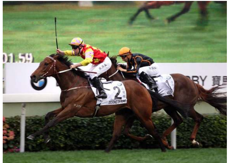
Designs On Rome outslugging Able Friend in a Hong Kong Derby for the ages in 2014