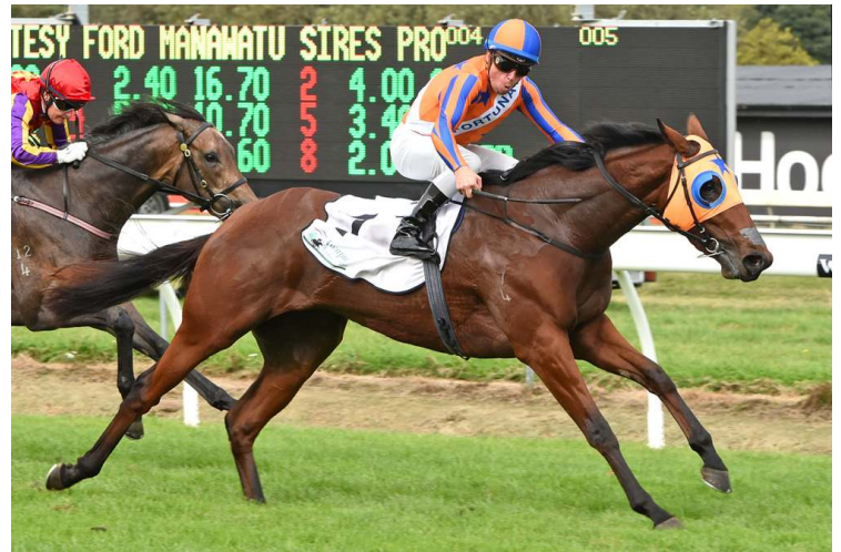
Melody Belle