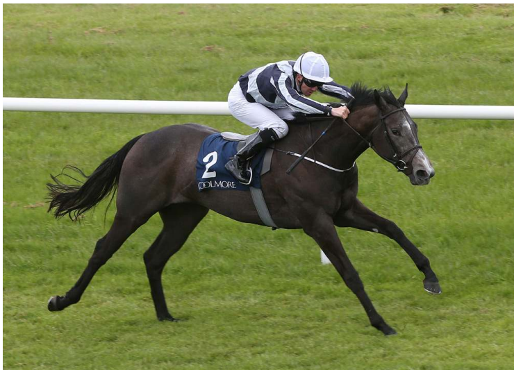
'TDN Rising Star' Alpha Centauri is Royal Ascot-bound | Racing Post