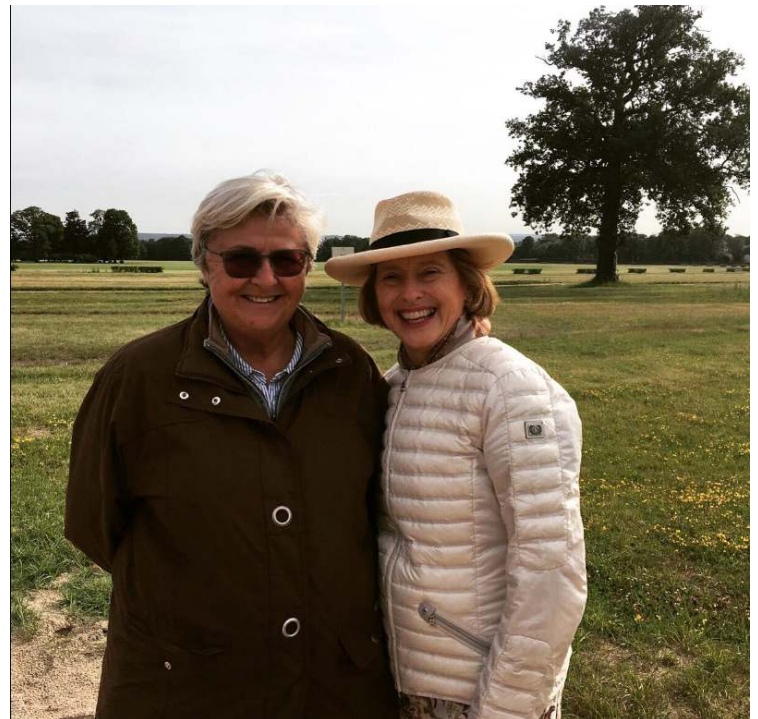
Leading trainers Crikette Head-Maarek and Gai Waterhouse in Chantilly