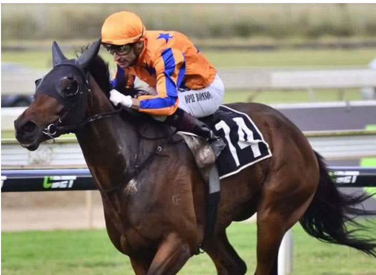
Shocking Luck | Te Akau Racing