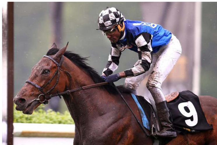
Red Cardinal (Ire) | galopponline.de