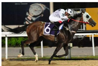
El Padrino

El Padrino (NZ) (Mr Nacho {Arg}), upset winner of the Mar. 14 Merlion Trophy, is a late invitee to the Mar. 29 G1 Golden Shaheen.