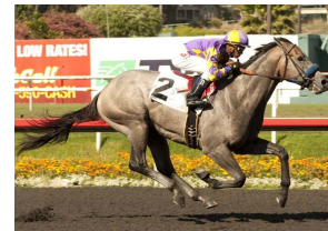
Kobe's Back Benoit