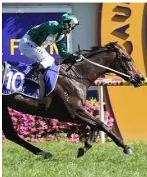
Samaready Racing and Sports