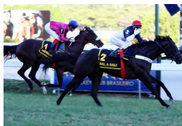
Bal a Bali wins the Brazilian Triple Crown

The actual record in the country of the samba and the "carnaval" is really incredible. Last Sunday, Bal a