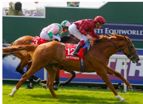
Wings Of Desire | Racing Post

Lady Bamford's high class homebred full-brothers Eagle Top (GB) (Pivotal {GB}) and Wings Of Desire (GB) (Pivotal {GB}) have been penciled in for separate Group 1 French missions over the next few weeks. Eagle Top, just touched off by Postponed (Ire)