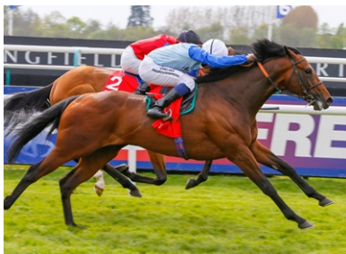
Humphrey Bogart | Racing Post