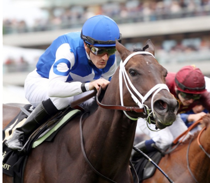
Tepin