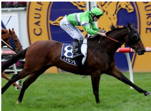
Precious Gem | Racing And Sports

Retiring with a record of 37-8-7-3 and earnings of A$660,400, the bay will relocate to Sledmere Stud in the Hunter Valley to be prepared for a mating with Coolmore first-season sire, 'TDN Rising Star' and 2015 G1 Golden Slipper hero Vancouver (Aus) (Medaglia d'Oro), who is also part-owned by the China Horse Club.