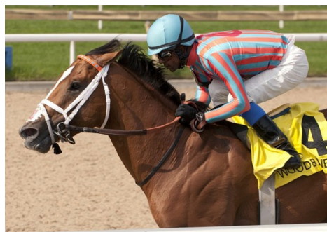
Conquest Enforcer