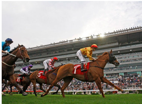
Gold-Fun