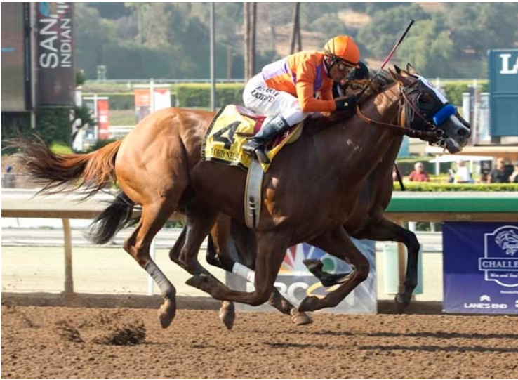
Lord Nelson takes GI Triple Bend S.