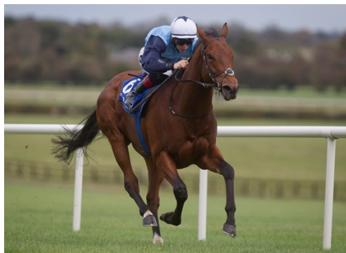
Endless Drama | Racing Post