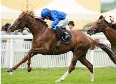
Hawkbill

The field for Saturday's G1 Coral Eclipse at Sandown has grown to a potential 11 starters, with two supplementary entries added on Monday. One of these is the Godolphin-owned Royal Ascot winner Hawkbill (Kitten's Joy). The 3-year-old colt is on a serious upward curve, having won his last five starts and he looked like his progression had not halted when winning the G3 Tercentenary S. at Royal Ascot.