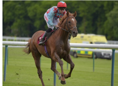
Red Verdon