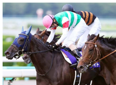
Marialite

The third race added to the series is the Oct. 2 G1 Sprinters S., which will award the winner with an automatic entry to the GI Breeders' Cup Turf Sprint.