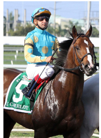
Z Camelot before 2012 Florida Derby