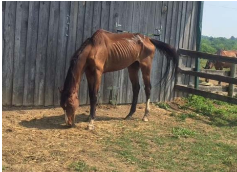
Z Camelot among horses at Kentucky Farm

The Mercer County Sheriff began investigating the horse farm after publication of the first US Racing article. But a dispatcher at the sheriff’s office told TDN on Monday that the KDOA and the county prosecutor’s office took over the case after the magnitude of neglect became evident.