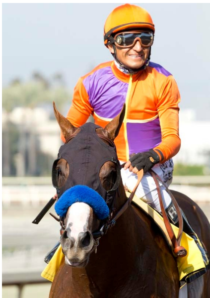
Lord Nelson

One of Lord Nelson's four grandparents, Pulpit's dam Preach, may well have channelled some of Mr. Prospector's speed, as she was fast enough to be placed in the GI Test S. and GII Prioress S. at three, even though she had won the GI Frizette S. over a mile at two.