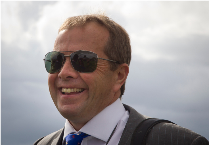
Ger Lyons