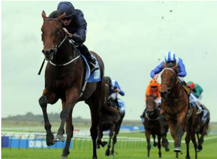
Air Force Blue winning the Dewhurst | Racing Post