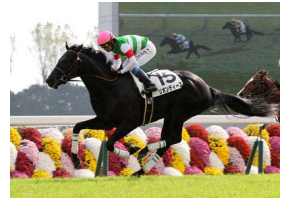
Leontes