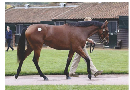
The Dubawi filly that topped Tattersalls' October Yearling Sale