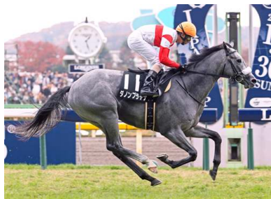
Danon Platina

Japanese record total of ¥5.1 billion, the equivalent at the time of nearly $43 million. His first runners did nothing to diminish his status when they reached the track in 2010, with Deep Impact running out an unchallenged winner, not only of the first-crop sires' championship, but also of the overall 2-year-old sires' championship. Although he didn't sire the winner of the Asahi Hai Futurity, he was responsible for both the second and third finishers.