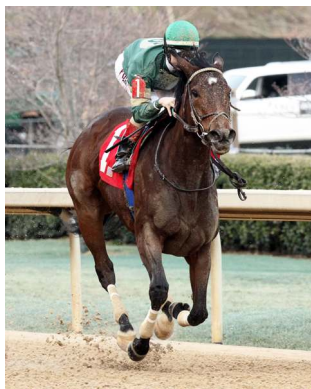
Don't Tell Sophia

Don't Tell Sophia is also a two-time defending winner of the Bayakoa S. at Oaklawn. She was second in last year's GIII Azeri S. and third in the GI Apple Blossom H. and was third in this year's GII Azeri. The mare missed this year's Apple Blossom with a quarter crack, but came back with a strong second half of the season, winning the GI Juddmonte Spinster and finishing second in the GI Breeders' Cup Distaff and GII Falls City H.