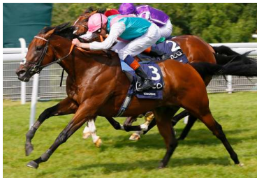
Kingman winning the 2014 Sussex Racing Post

Goodwood Racecourse and Qatar have entered into a 10-year sponsorship deal that is the most significant in the history of British racing. The deal will result in over £2 million being invested into prize money for eight races during the Qatar Goodwood Festival--also known as Glorious Goodwood--in 2015, with a commitment to increases year-on-year. Total prize money for the festival will total £4.5 million next year. The meeting's