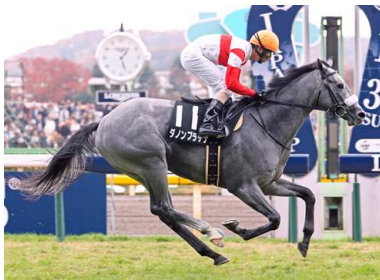
Danon Platina