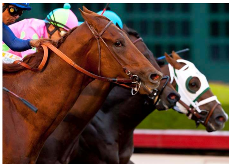
Dortmund gets nod in Futurity Benoit

The average field size, 7.46 starters per race, was down slightly from the fall meeting, but up over the summer meet. Officials blamed the decline on rainy weather during the winter meet.