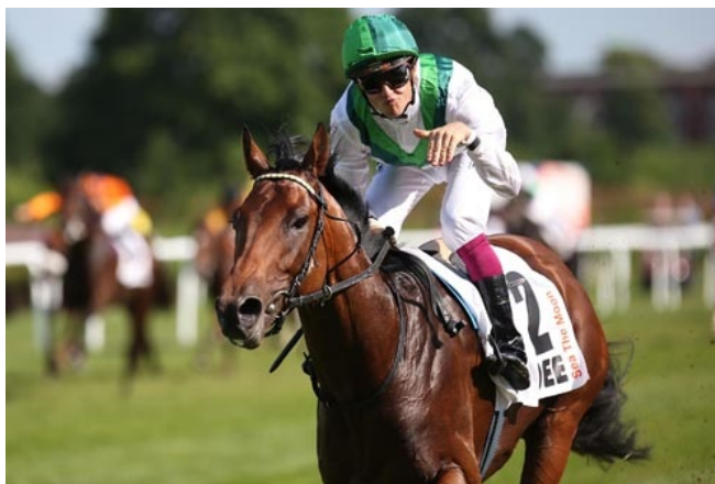
Sea the Moon and Christophe Soumillon well clear in the Deutsches Derby

Significantly, Sea the Moon's unraced dam Sanwa is a sister to two of Monsun's Derby winners, namely Samum and Schiaparelli.