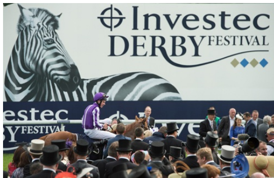
Australia after winning this year's Investec Derby

"The presence of the Queen is paramount, and she will be consulted before we make any such change," he said. The world's oldest Classic has endured scheduling changes in the past. Twenty years ago, the Derby was moved from its traditional Wednesday slot to Saturday.