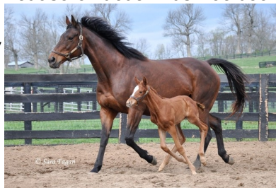
Secret Heart (SAf) with her '13 yearling colt by Kitten's Joy

Secret Heart (SAf) (Fort Wood--Secret Pact {SAf}, by Bush Telegraph {SAf}), the dam of 2010 Breeders' Cup Juvenile Turf winner Pluck for Team Valor International, was found dead in her stall Saturday morning at Denali Stud in Paris, Kentucky. A cause of death has not been determined. At the time of death, the 15-year-old, who was in foal to Point of Entry (Dynaformer), had a colt by Medaglia d'Oro at her side.