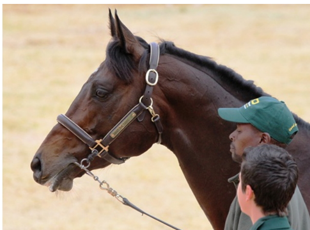
Await the Dawn

Fortunately for most, the storm that blew in as the race day was winding up gave fair warning of what was to come. Yet while Durban dropped to a comfortable 15 degrees celsius, Mooi River had dropped to four, something we only discovered upon arrival as the car door let in a blast of icy air. That meant a scurry for those carefully packed suitcases, hunting for scarves, hats and gloves--in fact, anything that could possibly keep the biting cold out.