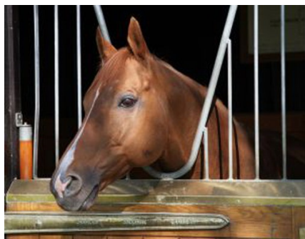
Lammtarra at Dalham Hall Darley

Sheikh Mohammed's triple Group 1 winner Lammtarra (Nijinsky--Snow Bride, by Blushing Groom {Fr}) was euthanized Sunday at Darley's Dalham Hall Stud in Newmarket, England at the age of 22 after battling a short illness.