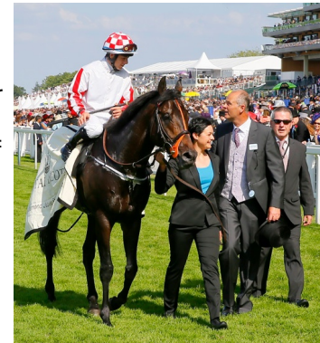
Slade Power