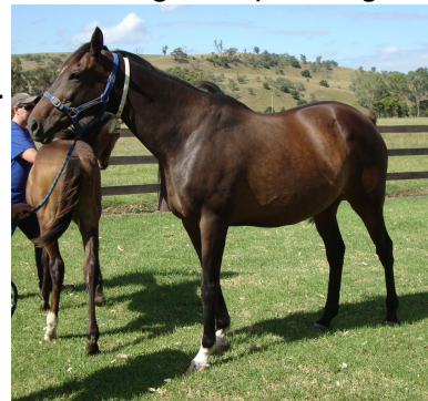
Makybe Diva at Coolmore Australia

Southern Hemisphere breeding season, according to Racing Post . Starspangledbanner, a multiple Group 1-winner in Australia and Britain, proved subfertile when retired to Coolmore in 2011, but has enjoyed outstanding results with his first Northern Hemisphere 2-year-olds, including Royal Ascot winners The Wow Signal (Ire) and Anthem Alexander (Ire). He now covers a limited book of mares at Rosemont Stud in South Australia, and his first Southern Hemisphere crop will hit the track later this year. Makybe Diva has produced four named foals, with her first produce Rockstardom (Aus) (Galileo {Ire}) her lone winner. She has a yearling colt by High Chaparral (Ire) and is currently in foal to All Too Hard (Aus).