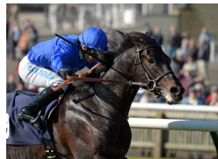
True Story Racing Post

Godolphin’s Listed Feilden S. winner True Story (GB) (Manduro {Ger}), most recently seventh in the G1 Investec Derby June 7, will bypass tomorrow’s