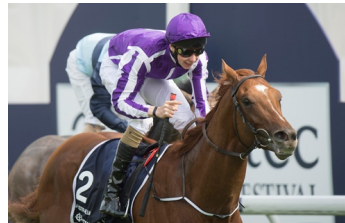
Australia Racing Post