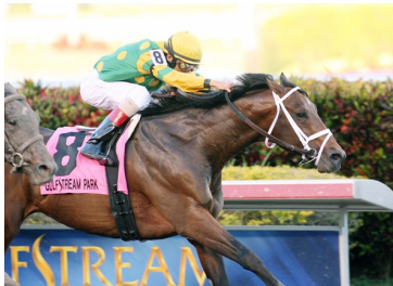
Palace Malice

Classic winner Palace Malice (Curlin) will make four more starts in 2014, including the GI Whitney Invitational at Saratoga Aug. 2.