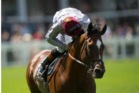
Toronado Racing Post

The catalogue for the Arqana August Yearling Sale is now available online. Set for Aug. 16 to 18 in Deauville, the sale will feature 365 yearlings over three