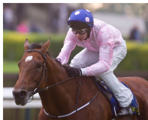
Granddukeoftuscany Racing Post

GRANDDUKEOFTUSCANY (IRE) (c, 3, Galileo {Ire} -- Crystal Valkyrie {Ire} , by Danehill ), who stayed on into sixth on debut over 12 furlongs at The Curragh June 8, was quickly sent into the lead. Asked to extend with a