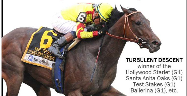
TURBULENT DESCENT winner of the Hollywood Starlet (G1) Santa Anita Oaks (G1) Test Stakes (G1) Ballerina (G1), etc.