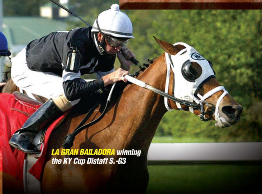
LA GRAN BAILADORA winning the KY Cup Distaff S. -G3