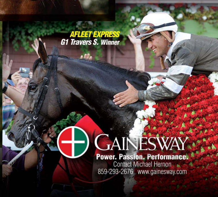
AFLEET EXPRESS G1 Travers S. Winner