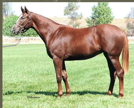
Hip 180: f. TAPIT - SCENERY CHANGE

featuring Cal-breds by Leading Sire TAPIT