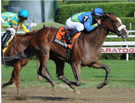
So Many Ways

produced Grade I winners Plum Pretty (Medaglia d'Oro), the victoress of last year's GI Kentucky Oaks and this year's GI Apple Blossom S.; and Ask the Moon (Malibu Moon), a $45,000 purchase of 2006 who recorded a Grade I double last year in the GI Ruffian S. and the