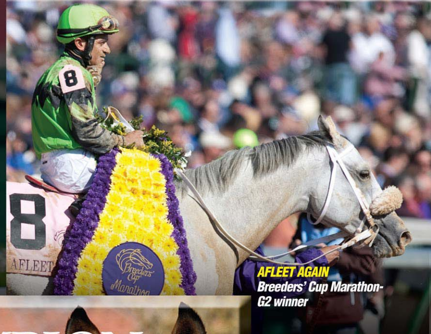
AFLEET AGAIN Breeders' Cup Marathon- G2 winner