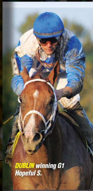
DUBLIN winning G1 Hopeful S.