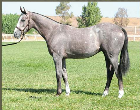
Hip 93: c. TAPIT - HELLUVA HOOLEY

LIBERTY ROAD STABLES, HAVENS BLOODSTOCK AGENCY, INC., AGENT