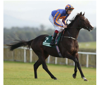
Battle of Marengo Racing Post

Recording a 12th success for Aidan O'Brien in The Curragh's G2 Juddmonte Beresford S., a Derby pointer and "Win and You're In" qualifier for the Nov. 3 GI Breeders' Cup Juvenile Turf, Battle of Marengo (Ire) (Galileo {Ire}) stated his claims for next year's Blue Riband with an uncomplicated staying performance yesterday. Third on debut over seven furlongs at Leopardstown Aug. 9, the bay took a giant leap forward when scoring by 11 lengths in a maiden over that trip at Gowran Park 12 days later. He made all the running in the Listed Breeders' Cup Juvenile Turf Trial S. over a mile at Leopardstown last time Sept. 8. Taking a lead from Orgilgo Bay (Ire) (Lawman {Fr}) here, he was woken up on the home turn and assumed control at the quarter pole en route to a decisive 3 1/2-length score. Orgilgo Bay held second narrowly from Probably (Ire) (Danehill Dancer {Ire}) "He is tough, as he was not liking that ground," jockey Joseph O'Brien explained. "Wait until he gets better ground in the G1 Racing Post Trophy [at Doncaster Oct. 27] or something like that. He's a very straightforward horse with a great attitude and he's gone the last 100 yards on the bridle. He's done nothing wrong any horse that wins a maiden by 11 lengths, regardless of what type race it is, has to have ability and he proved that today." Cont. p6