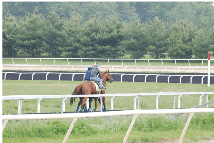
The Derby winner takes in his surroundings at Fair Hill