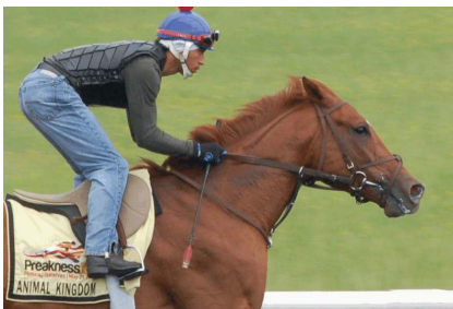
Animal Kingdom in action at Fair Hill

With the majority of GI Preakness S. starters slated to arrive at Pimlico late on Wednesday, the place to be yesterday morning was Fair Hill Training Center, current digs of GI Kentucky Derby hero Animal Kingdom