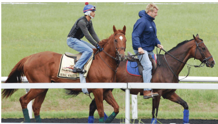
Animal Kingdom checks out the action at the clocker's stand