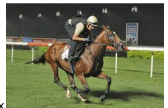
Presvis Singapore Turf Club

Globetrotting Presvis (GB) (Sakhee) took the Kranji turf for the first time since his arrival last Sunday and will look to register his first win in the Cup at his third attempt. The reigning G1 Dubai Duty Free S. winner was a head second behind Gloria de Campeao (Brz) (Impression {Arg}) in 2009, but could do no better than a midpack fifth, six lengths behind Lizard's Desire (SAf) (Lizard Island {Aus}) last year.