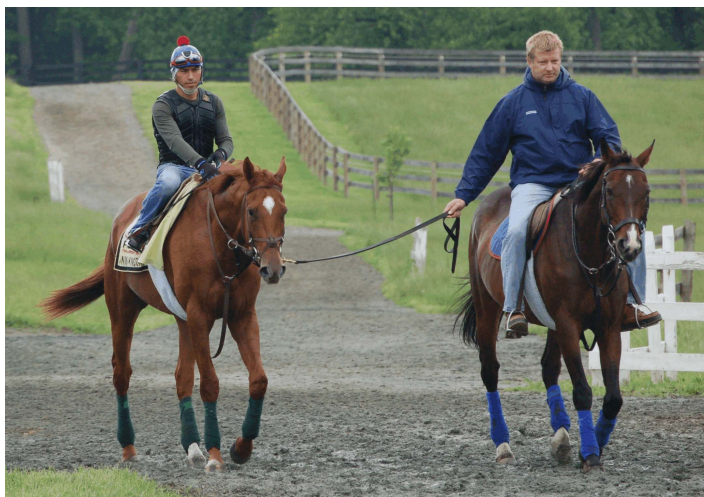
...heading back to the barn

DID YOU KNOW... The last 3-year-old to be champion without winning a Triple Crown race was TIZNOW in 2000.