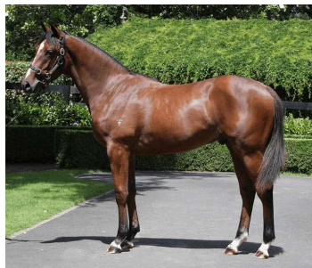
Lot 867 www.nzb.co.nz