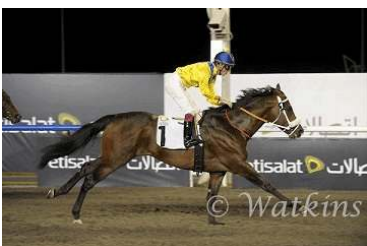
Bold Silvano

Leaving the eighth pole and with the result all but a formality, Christophe Soumillon took a look to his left at the infield screen. His mount Bold Silvano (SAf) (Silvano