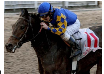
Ron The Greek