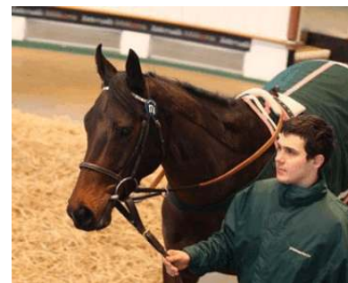
Full Steam