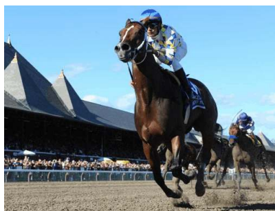
Champagne d'Oro

If Southern Equine Stable's Champagne d'Oro runs back to either her 39-1 upset in the GI Acorn S. on the GI Belmont S. undercard or GI Test S. tour-de-force