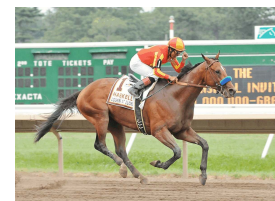
Lookin At Lucky

GI Preakness S. hero Lookin At Lucky , who missed by inches in the 2009 BC Juvenile, takes on his elders after three straight wins against his peers. The consistent bay missed some time following his victory in the GI Haskell Invitational S. Aug. 1, but he bounced back with a professional tally in the GI Indiana Derby Oct. 2, and has been training smartly since. A troubled sixth after breaking from the rail in the GI Kentucky Derby, 'Lucky has the outside post this time. He looked a picture when he galloped under the Twin Spires Wednesday morning.