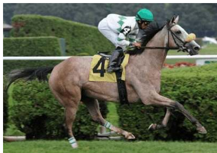
Winter Memories

Winter Memories went off the 5-2 choice in her unveiling at Saratoga Sept. 3 and, despite ducking in at the quarter pole, looked more like 1-2 shot as she rolled