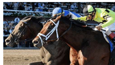
Blame besting Quality Road in the Whitney

Quality Road, an infamous gate scratch from last year's Classic, captured the GI Donn H. and GI Metropolitan H. before being a bit overconfidently ridden in his Whitney loss. The handsome four-year-old didn't have much to beat when rebounding in the GI Woodward S. at Saratoga Sept. 4, and hasn't faced the starter in