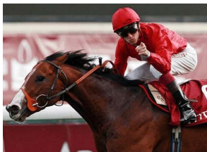
Paco Boy

Gio Ponti, second in last year's GI BC Classic, got caught late in the 1 1/4-mile GI Arlington Million in August. Turned back to a mile last time out, the two-time Eclipse champion was a strong winner of the Oct. 9 GI Shadwell Turf Mile at Keeneland. That performance convinced connections to stick to the Mile this year, rather than attempting a second Classic. "As tempting as the Classic is, we were awed with his last