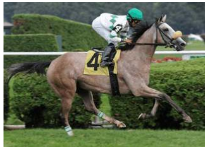
Winter Memories