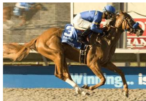
Tell A Kelly

Tell A Kelly endured a tardy break, failed to fire and had to settle for fifth in her career bow over Del Mar's Polytrack July 25. Settled a little closer to the early pace next time out at the oceanfront track, the Florida-bred filly responded to win by 2 1/2 lengths Aug. 15. Benefiting from some crisp opening fractions in the GI Darley Debutante S. Sept. 4, the chestnut proved much the best, scoring by 4 1/2 lengths over the well-regarded Wickedly Perfect. Conversely, the filly was victimized by pedestrian early splits last