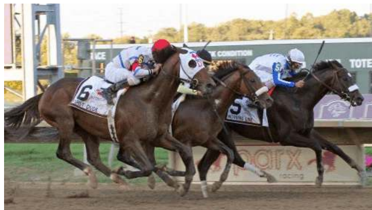
BC Dirt Mile morning-line favorite Morning Line (Tiznow) fending off A Little Warm and First Dude in the GII Pennsylvania Derby