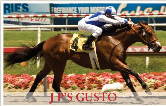
Benoit & Assoc.