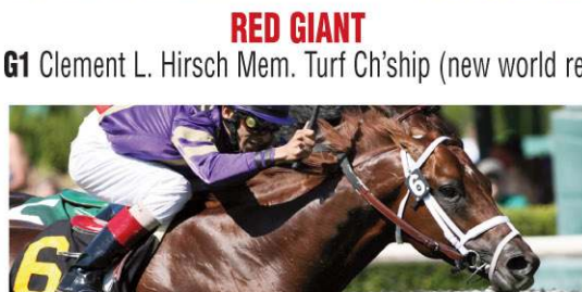
RED GIANT Won G1 Clement L. Hirsch Mem. Turf Ch'ship (new world record).