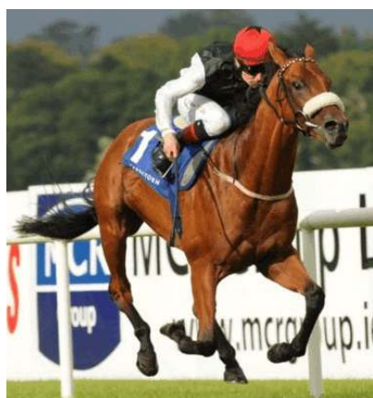
A Word Apart breaking his maiden at Leopardstown Sept. 4