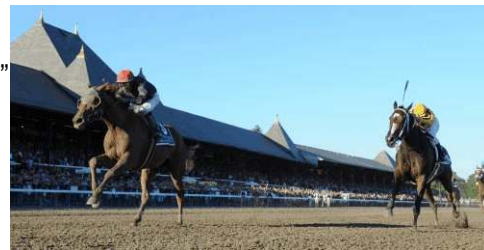
Persistently, whose dam will sell at KEENOV, defeating Rachel Alexandra