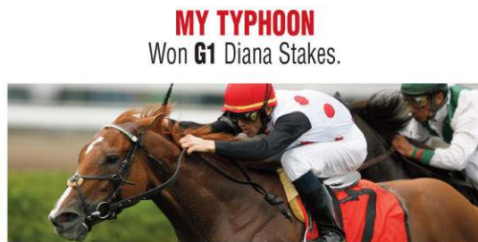
MY TYPHOON Won G1 Diana Stakes.