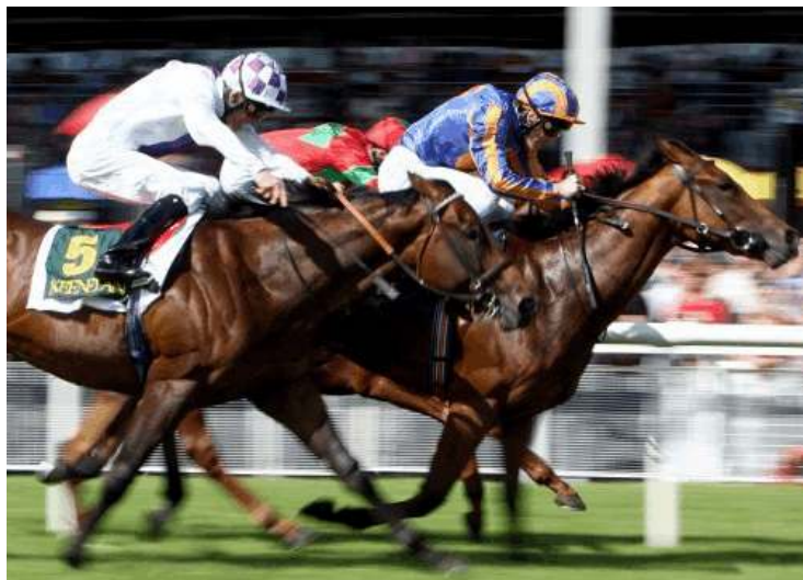
Zoffany edging Glor Na Mara in the G1 Keeneland Phoenix S. last out. The colts will face off once more in Saturday's G1 Vincent O'Brien National S.