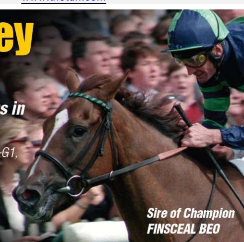
Sire of Champion FINSCEAL BEO