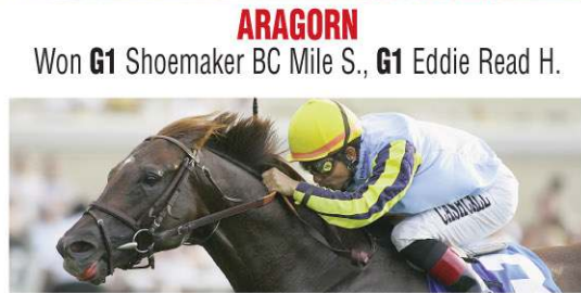
ARAGORN Won G1 Shoemaker BC Mile S., G1 Eddie Read H.