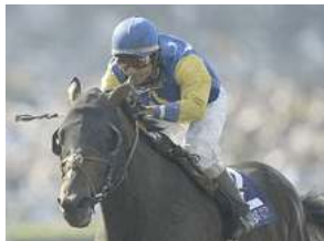
Pleasantly Perfect winning the BC Classic