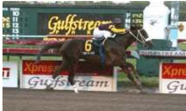
Trust N Luck