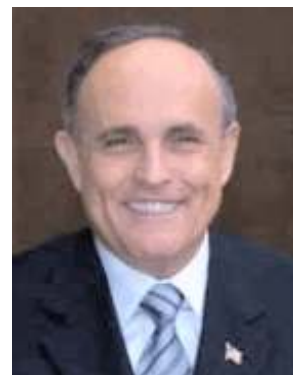
Rudy Giuliani