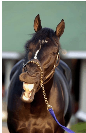
War Emblem

War Emblem (Our Emblem) worked an easy five furlongs at Churchill Tuesday in preparation for Saturday's GI Preakness S. The Derby winner completed the work in 1:03.20 over a fast track.